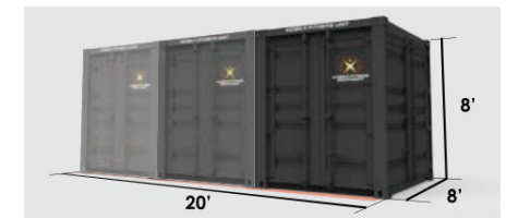
Tricon IV Configuration